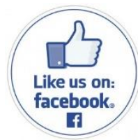
Figure 11: From Christian Co. HD

"...public health promotes and protects the health of people and the communities where they live, learn, work, and play."